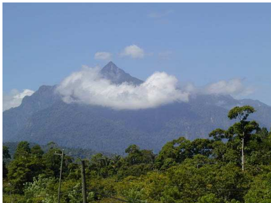
Pico Bonito Mountain

Generally speaking Honduras is famous for its mountains as more than the 80 percent of the country is covered by them as well for its tropical forests. The most famous mountain is called Pico Bonito